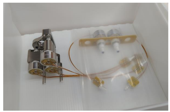
Figure 1: Example packaging with 1x CTTPS1/2

Do not cut the membrane plastic. Keep the box in case products need to be returned.