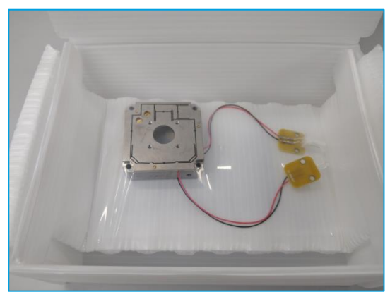
Figure 1: Example packaging with 1x CLS2-XY

Do not cut the membrane plastic. Keep the box in case products need to be returned.