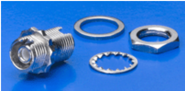
Figure 3: FC/APC female/female adapter

The default Ambient Fiber (AF5) cable can be connected to the FC/APC narrow key (male) connector only by using the supplied FC/APC female/female adapter (Molex 106152-3000) . If not in use, always keep metal screw-on cap on connector and/or adapter. If any custom cabling is required, please consult the Getting Started Guide (MANoo).