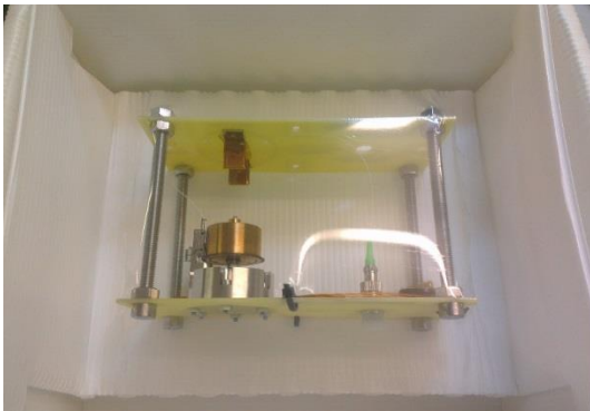
Figure 1: PCB Transport tool for CRM 1 -COE

Systems equipped with a Cryo Optical Encoder (product type option –COE) are mounted in a dedicated PCB Transport tool to guard the encoder grid and optical fiber.